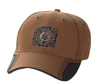
CANVAS CAP Brown canvas with black accents. Tan and black VFW Emblem embroidered on this sixpanel, medium profile, cap. Hookand-loop back strap. Imported. 7226 $17.95