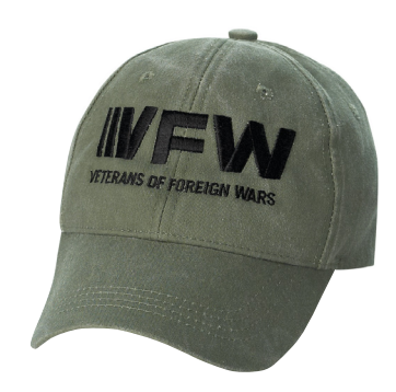
OD GREEN VFW CAP Cotton twill with embroidered VFW Logo in black. Sixpanel, medium profile with hook-and-loop back strap. Imported. 7194 $21.95