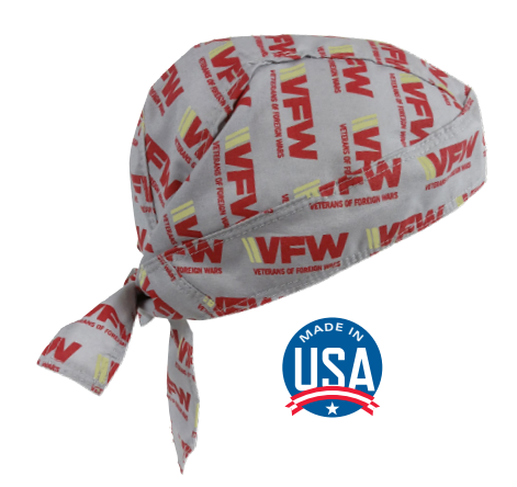
VFW DO-RAG Adjustable with back ties; one size fits most. Printed with the VFW Logo. Made in the USA. 7165 $16.00