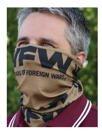
COYOTE BROWN GAITER Lightweight, stretchy, seamless 100% polyester can be worn several ways. One size fits most. 10 x 20" with black VFW Logo screen printed. Imported. Due to this type of product, we will not accept returns. 1979 $5.00