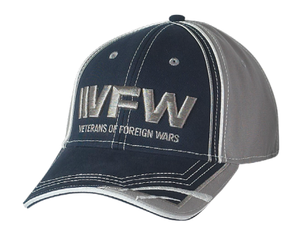
NAVY AND GRAY CAP Brushed cotton twill cap has 3-D embroidered VFW Logo and white sandwich bill. Structured, medium profile, six-panel cap with hook-and-loop back strap. Imported. 7203 $16.95