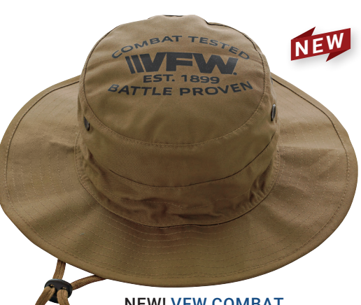
NEW! VFW COMBAT TESTED BOONIE 55/45 cotton/polyester. Coyote brown with screenprinted Combat Tested logo on top. Adjustable chin strap. Imported; decorated in the USA. 7187 $21.95