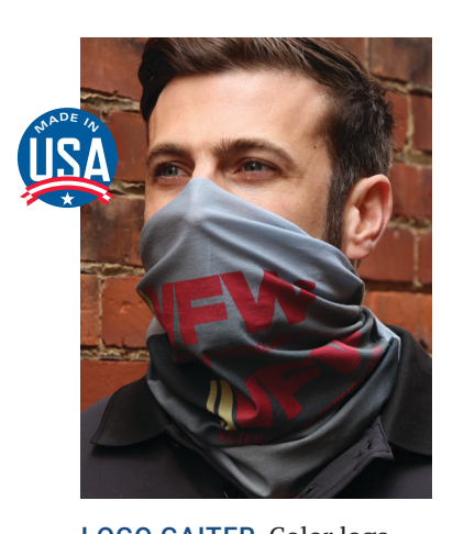
LOGO GAITER Color logo on gradient gray background. 100% polyester microfiber. 9 x 19". Machine washable. With vinyl storage bag. Not medical grade. Made in the USA. Due to this type of product, we will not accept returns. 1965 $14.95 While quantities last.