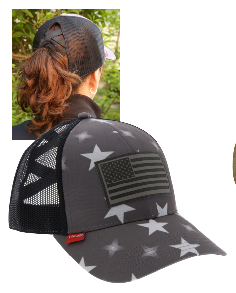
PONYTAIL CAP Elastic criss-cross ponytail opening. 100% polyester with leather U.S. flag patch. With "Est. 1899" on red tag. Adjustable hook-and-loop back strap. Imported. 7154 $16.95