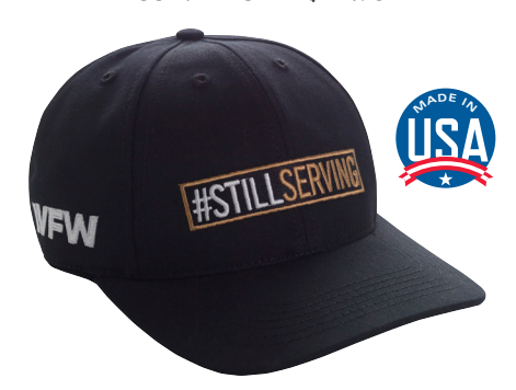
#STILLSERVING CAP Six-panel, medium profile cotton twill. #StillServing and VFW Logo embroidered. Buckle back adjuster. Made in the USA. 7920 $31.95 See page 70 for more #StillServing