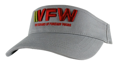
VFW VISOR Gray medium weight cotton twill. 3D émbroidered logo. Hook-and-loop back strap. Imported. 7132 $18.95