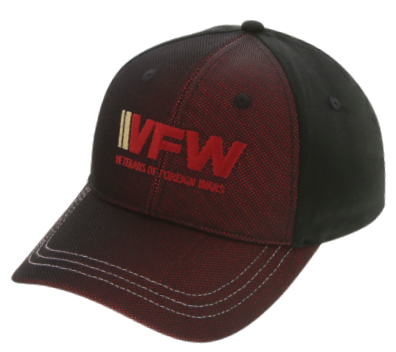
VFW CAP VFW Logo embroidered. Red with black mesh front and bill, black brushed twill sides, six-panel, medium profile with hook-and-loop back strap. Imported. 7176 $18.95