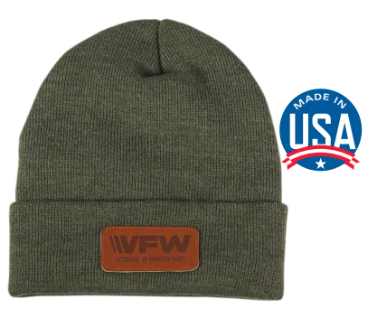
LEATHER PATCH KNIT CAP Olive heather knit cap with debossed leather patch with the VFW Logo. Made of 3M Thinsulate® material. Made in the USA. 7174 $31.95