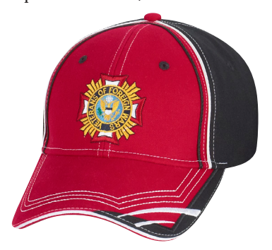
RED AND BLACK CAP Cotton twill, structured, medium profile, six-panel cap with white sandwich bill. Embroidered with VFW Emblem. Hook-and-loop back strap. Imported. 7202 $16.95