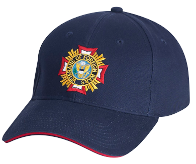
NAVY BLUE VFW CAP Brushed cotton twill cap with red sandwich bill, embroidered full color VFW Emblem. Medium profile, six-panel cap with hook-and-loop back strap. Imported. 7200 $14.95